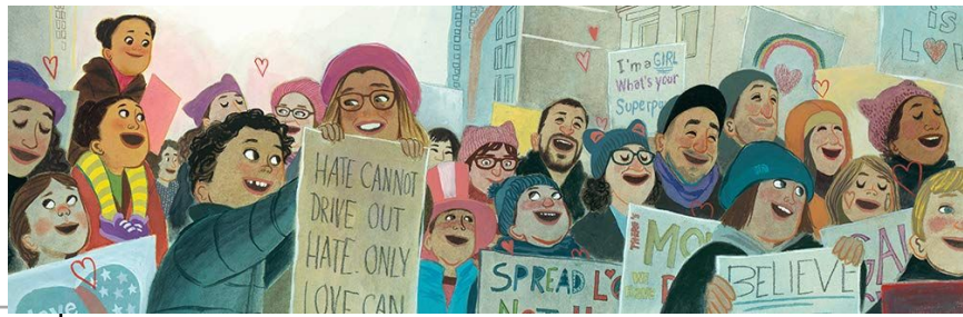
Illustration 2020 © LeUyen Pham