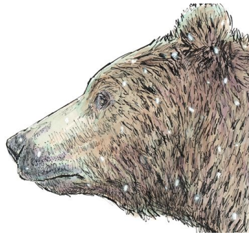
Illustration 2021 © Matthew Cordell