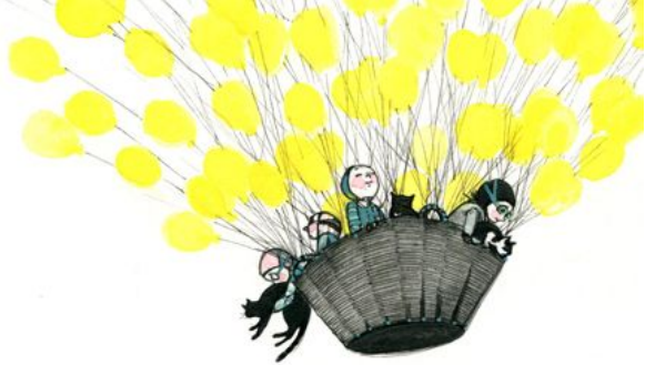
Illustration 2017 © Corinna Luyken