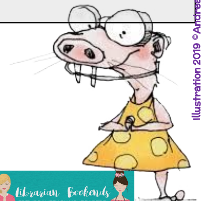
Illustration 2019 © Andrea Zuill