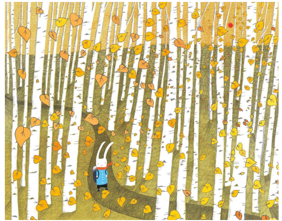
Illustration 2020